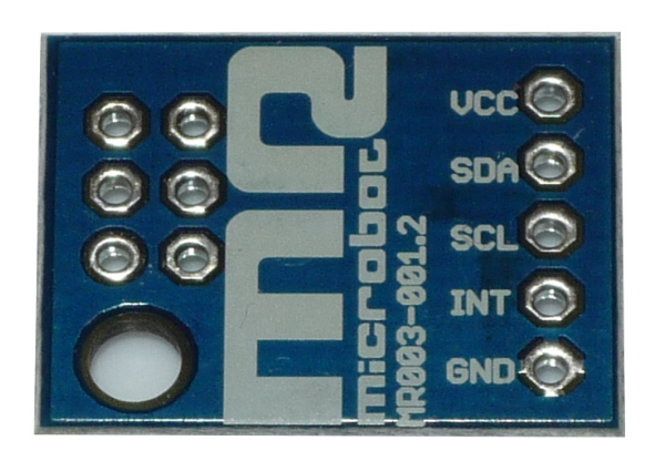
Fig. 2 - Signals