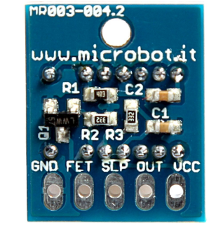
Tab.1 – Connections