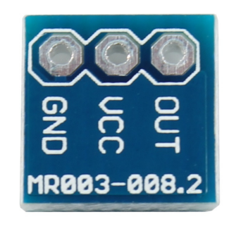
Tab.1 - Connections